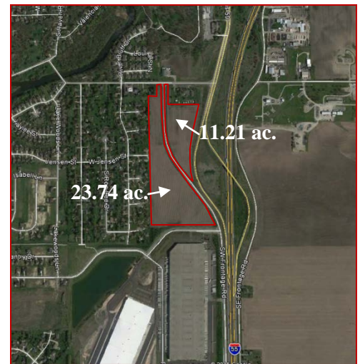
(Zoomed in Aerial)

519 Franklin St. Suite 102 Morris, IL 60450 www.MARQUETTEPROPERTIES.com